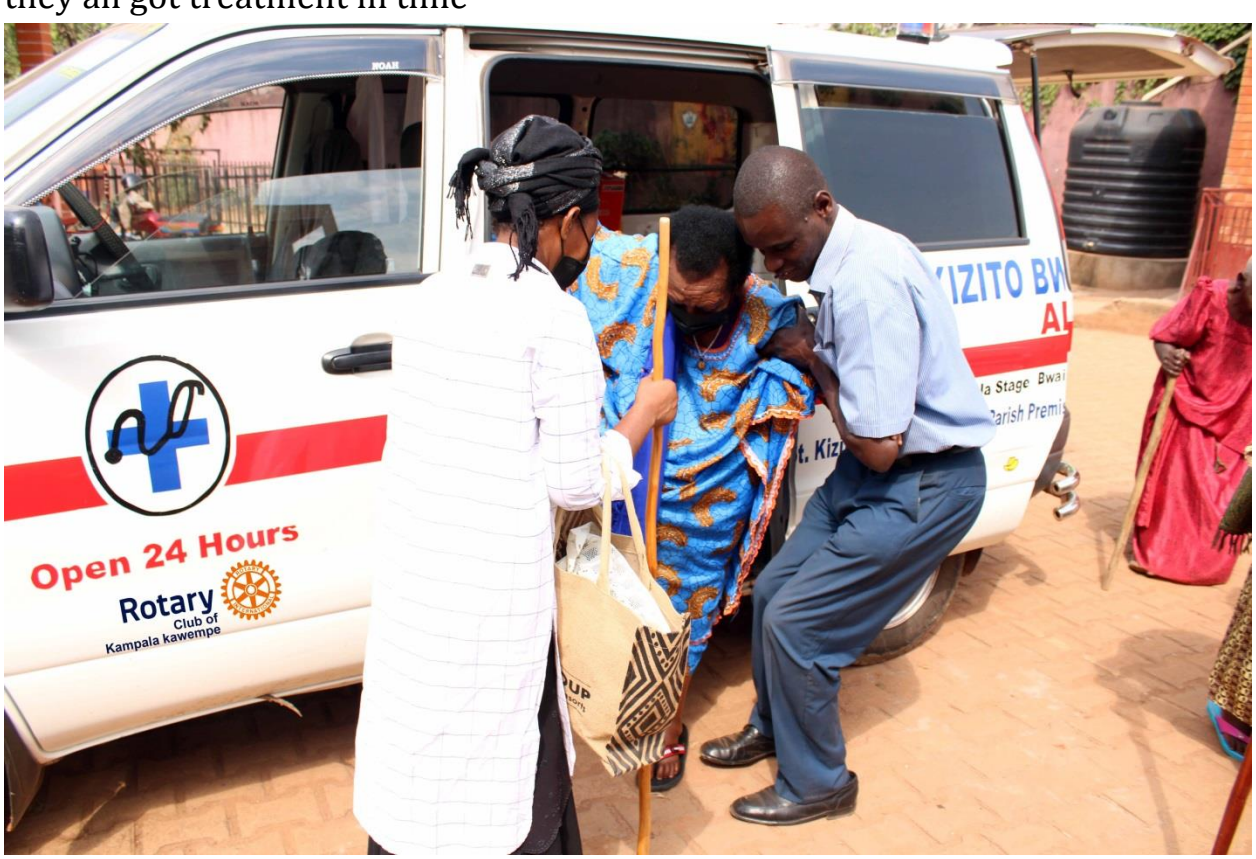
they all got treatment in time